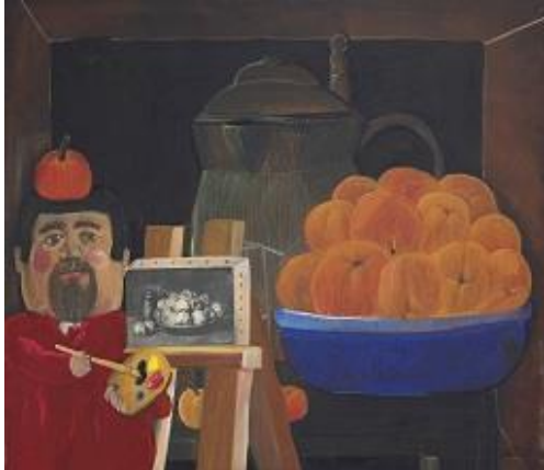
Self-portrait with Still Life (After Courbet), 1963

Born in Colombia in 1932, Fernando Botero left matador school to become an artist, displaying his work for the first time in a 1948. His subsequent art, now exhibited in major cities worldwide, concentrates on situational portraiture united by his subjects' proportional exaggeration. This style is called Boterismo.