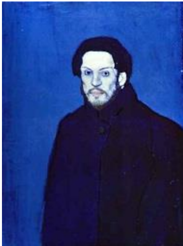
Self-portrait, 1901

Pablo Picasso was born in Spain in 1881, and was raised there before going on to spend most of his adult life working as an artist in France. Throughout the long course of his career, he created more than 20,000 paintings, drawings, sculptures, ceramics and other items such as costumes and theater sets. He is universally renowned as one of the most influential and celebrated artists of the twentieth century.