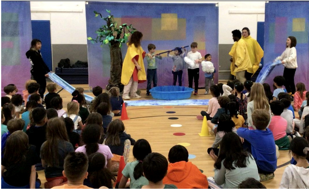
Earth Day performance of Mother Earth and Me by Smithsonian Discovery Theater. Thank you to APS Humanities Project for funding this performance.